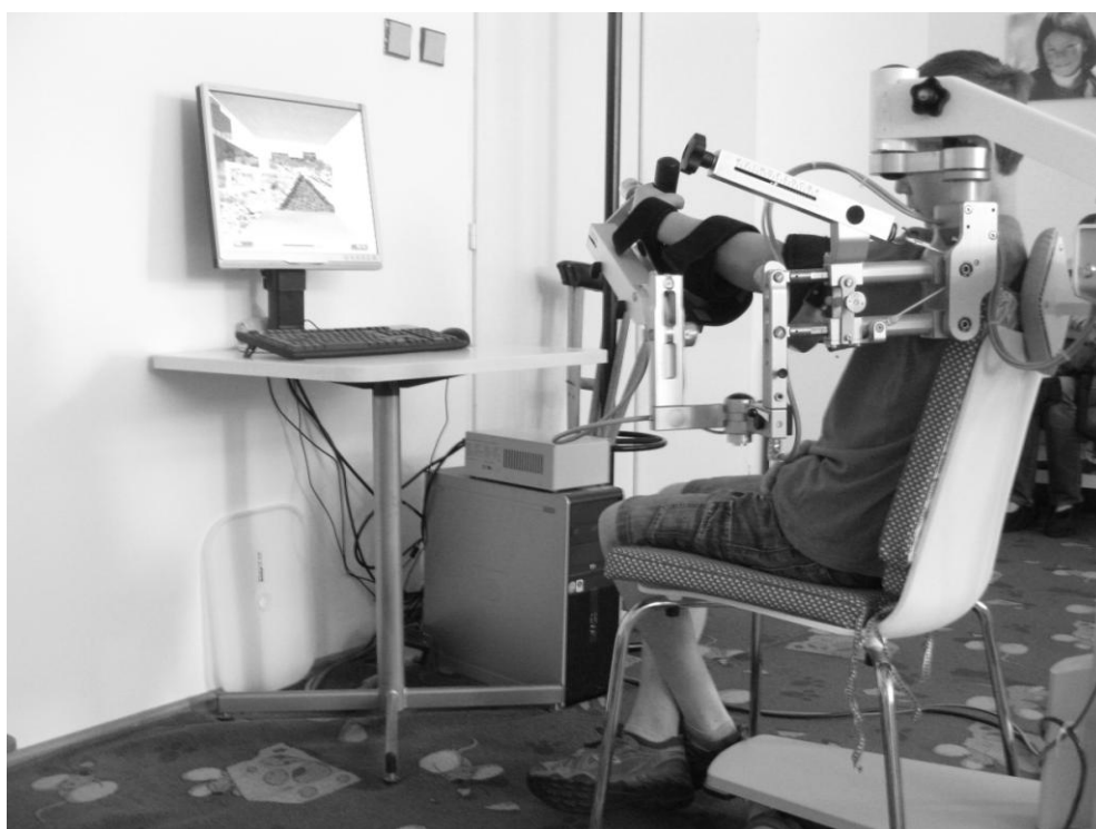
Figure 1. Training in 3D workspace

The purpose of this study was to determine the effect of therapy in the system Armeo® and on the movements and the grip's of the ability of upper extremity in children with hemiparesis syndrome. In a pilot study, we sought to identify and verify the extent to which Armeo® equipment can effect the functionality of self-sufficiency and improve paretic of upper extremity in children with hemiparesis syndrome. Even though we know that the complete elimination of hemiparesis is impossible, we believe that hemiparesis upper extremity can effect to a large extent, so much so that children can improve their independence and quality of life.